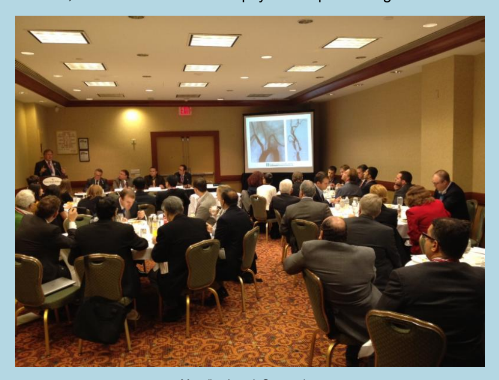
Magellan Lunch Symposium

Growing interest in Intravascular Robotics was evident at this year's VEITHsymposium. Magellan was featured in 8 presentations by 6 different physicians. The Hansen Medical booth was busy throughout the week, with a record number of physicians performing test drives.