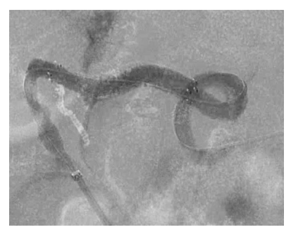
Final result showing exclusion of the aneurysm

takeaway was the diversity of cases in which Magellan is providing clinical benefit.